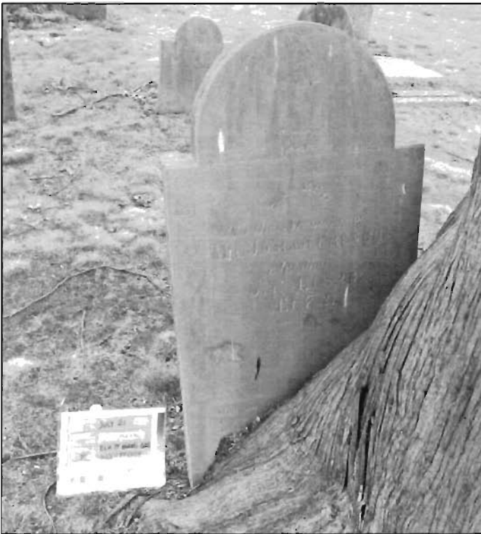
Tree growing into a slate headstone. Excavation and resetting a foot away is sufficient to prevent damage to both the monument and the tree.

Finally, slate is as susceptible to landscape maintenance as any other stone, being readily damaged by mowers, trimmers and trees.