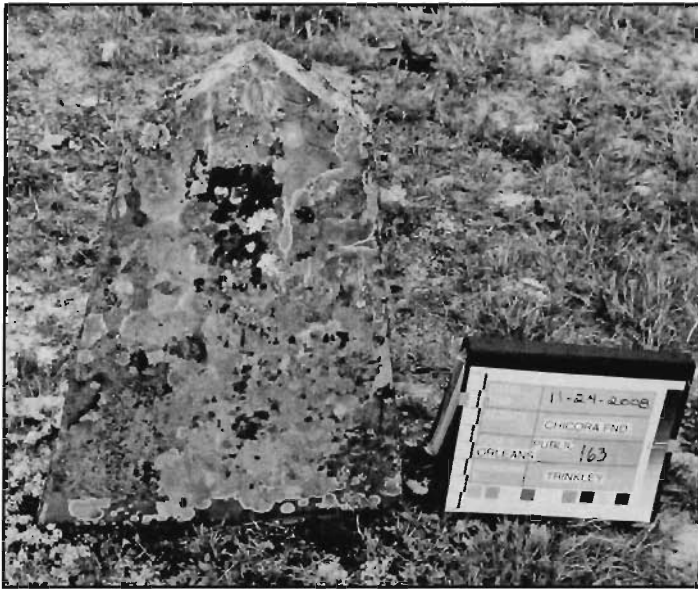
The inscription on this stone has been completely obscured by heavy lichen growth that requires treatment with a biocide in order to allow the stone to be legible.

—Michael Trinkley, Chicora Foundation, Inc. trinkley@chicora.org