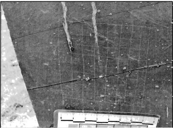
Although slate is hard, it is not immune from graffiti. Here a vandal has inscribed a checkerboard on the back of a stone.