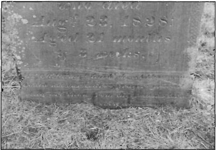
Extensive mower damage (losses along the edges) and nylon trimmer (parallel striations) damage on this otherwise beautiful stone.