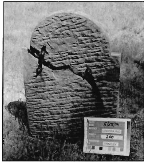
Example of an old repair using ferrous straps and bolts. As these corrode, the iron jacking will begin cracking the stone causing additional damage.