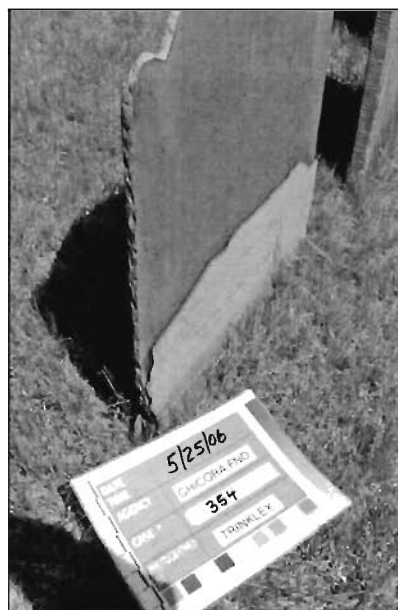
Cracking and spalling with the entire face of the slate headstone lost.