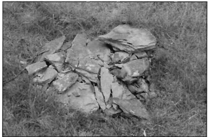
In this case the mower ran over the slate stone hidden by tall grass. Here the remnant pieces are piled up.