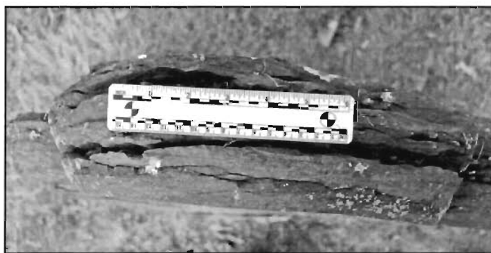
Example of spalling with extensive damage. Notice the leaves and vegetation in the cracks.

So what causes slate deterioration? One documented factor may be seasonal saturation and desiccation in climates with distinct wet and dry seasons. Rainwater infiltrates the stone; where clay minerals are present along cleavage traces, the rock can be hydrated, causing expansion. As the stone dries or dehydrates, there is shrinkage. Cracks develop along the cleavage planes, thus exposing the stone to additional damage.