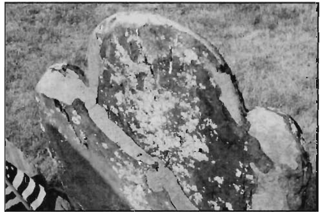
Cracks repaired in the past using a mortar to shed water. Although not color matched, the infill has served its purpose, but is beginning to crack and requires replacement.