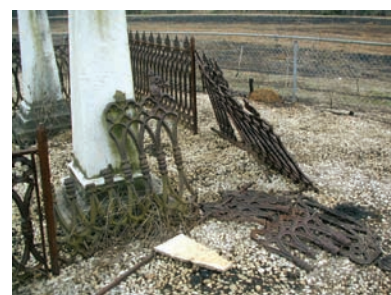
Before and after photographs of a fence treated by Chicora's conservators at Richardson Cemetery in Clarendon County, SC.

Two thin coats are always better than one thick coat and will keep the fence looking good for years.