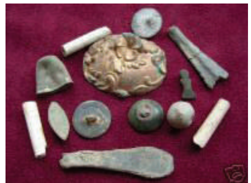
Artifacts like these are daily being sold on Ebay by relic collectors more interested in profiteering than preserving history.

“These digs are like reading a book, ripping the pages out as you read and setting them on fire.”