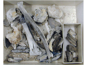
Example of burned human remains.

The second half-day workshop was an overview of techniques associated with determining the time since death, such as algor mortis, rigor mortis, and livor mortis, focusing on errors and problems inherent in these various techniques. Most of the workshop was devoted to decomposition – and determining the time since death on more difficult cases.